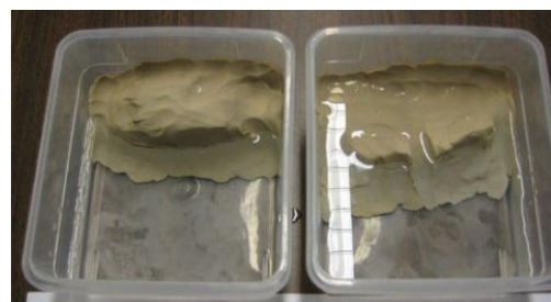
Ice on Land