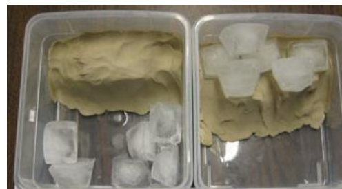
Ice on Land